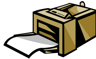
Caption describing picture or